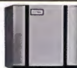
CIM0320A / CIM0520A

IOM Discount = 60.1% / EP Discount = 50% Reference 01: # BC-04-02-15-23 (Leon County) Reference 02: # 18042 (Palm Beach County)