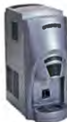
GEMD270A 12 lb Ice Storage