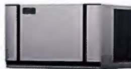
CIM1446 / 1846 / 2246