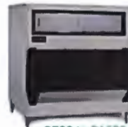
B700 to B1600