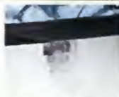
Cap Activated Dispensing