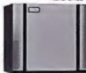
CIM0836 / CIM1136