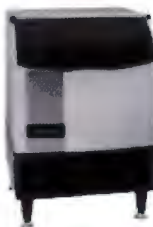
ICEU150A / ICEU220A