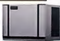
CIM0330 / 0430 / 0530 / 0636