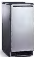
GEMU090 22 lb Ice Storage