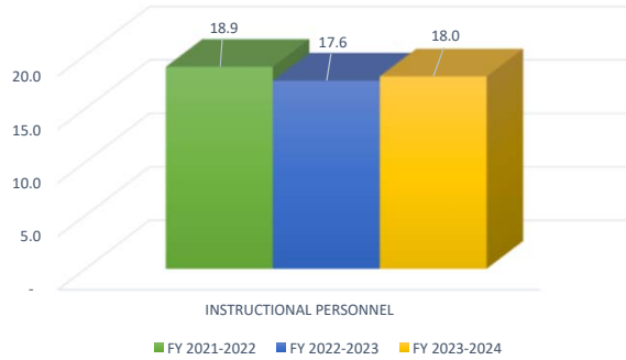
RATIO OF FULL-TIME EQUIVALENT STUDENTS TO FULL-TIME EQUIVALENT INSTRUCTIONAL PERSONNEL