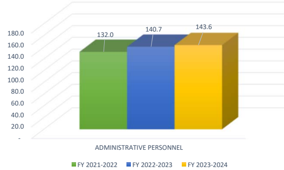
RATIO OF FULL-TIME EQUIVALENT STUDENTS TO FULL-TIME EQUIVALENT ADMINISTRATIVE PERSONNEL