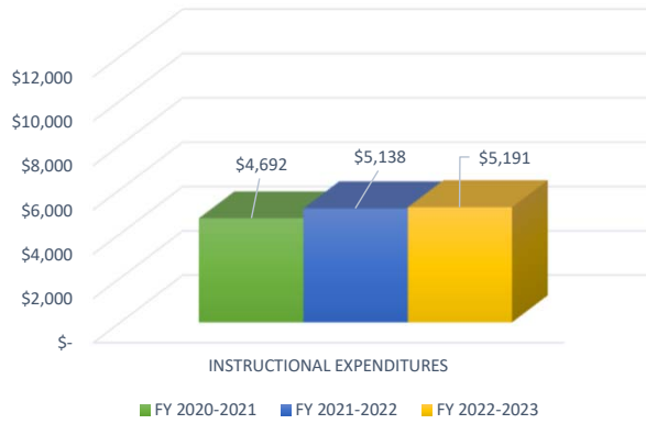
TOTAL INSTRUCTIONAL EXPENDITURES PER FULL-TIME EQUIVALENT STUDENT