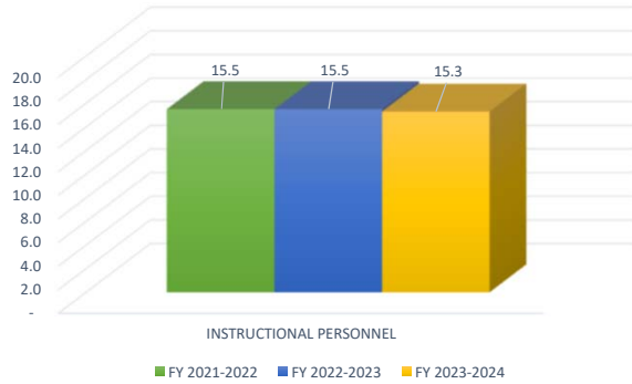
RATIO OF FULL-TIME EQUIVALENT STUDENTS TO FULL-TIME EQUIVALENT INSTRUCTIONAL PERSONNEL