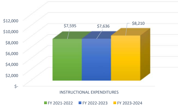
TOTAL INSTRUCTIONAL EXPENDITURES PER FULL-TIME EQUIVALENT STUDENT