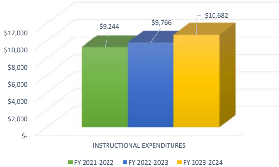
TOTAL INSTRUCTIONAL EXPENDITURES PER FULL-TIME EQUIVALENT STUDENT