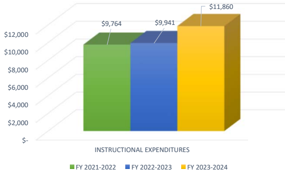
TOTAL INSTRUCTIONAL EXPENDITURES PER FULL-TIME EQUIVALENT STUDENT