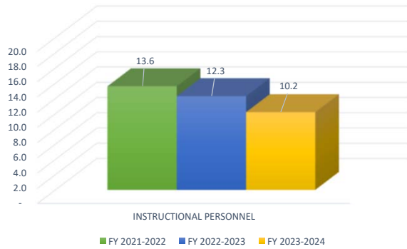
RATIO OF FULL-TIME EQUIVALENT STUDENTS TO FULL-TIME EQUIVALENT INSTRUCTIONAL PERSONNEL