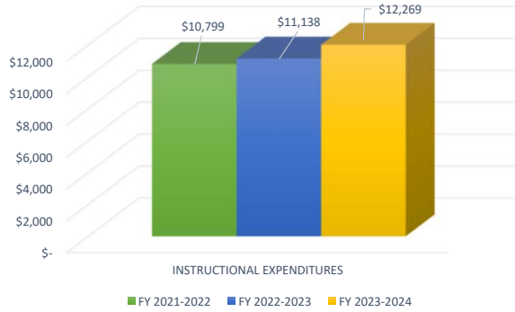
TOTAL INSTRUCTIONAL EXPENDITURES PER FULL-TIME EQUIVALENT STUDENT