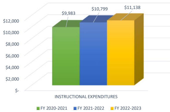
TOTAL INSTRUCTIONAL EXPENDITURES PER FULL-TIME EQUIVALENT STUDENT