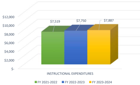
TOTAL INSTRUCTIONAL EXPENDITURES PER FULL-TIME EQUIVALENT STUDENT