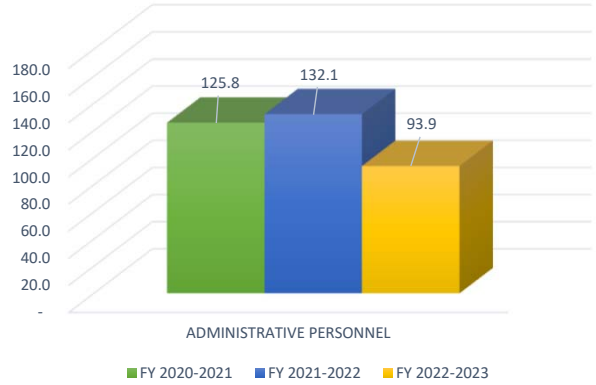
RATIO OF FULL-TIME EQUIVALENT STUDENTS TO FULL-TIME EQUIVALENT ADMINISTRATIVE PERSONNEL