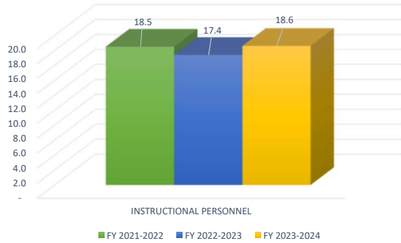
RATIO OF FULL-TIME EQUIVALENT STUDENTS TO FULL-TIME EQUIVALENT INSTRUCTIONAL PERSONNEL