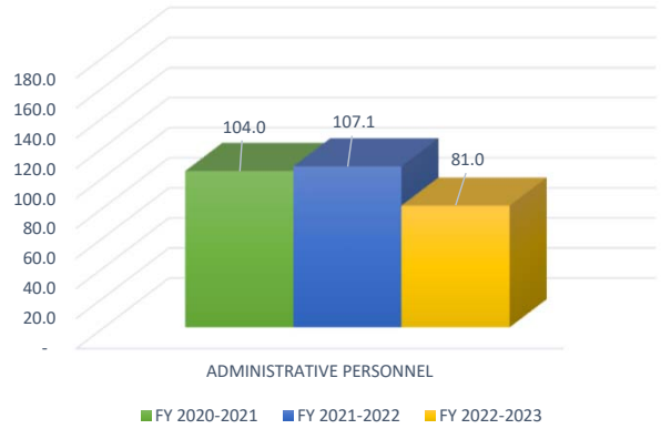
RATIO OF FULL-TIME EQUIVALENT STUDENTS TO FULL-TIME EQUIVALENT ADMINISTRATIVE PERSONNEL