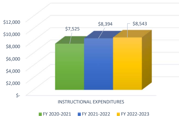
TOTAL INSTRUCTIONAL EXPENDITURES PER FULL-TIME EQUIVALENT STUDENT