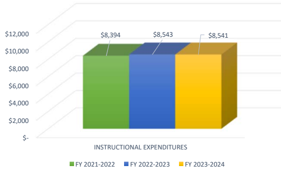
TOTAL INSTRUCTIONAL EXPENDITURES PER FULL-TIME EQUIVALENT STUDENT