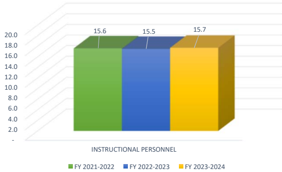
RATIO OF FULL-TIME EQUIVALENT STUDENTS TO FULL-TIME EQUIVALENT INSTRUCTIONAL PERSONNEL