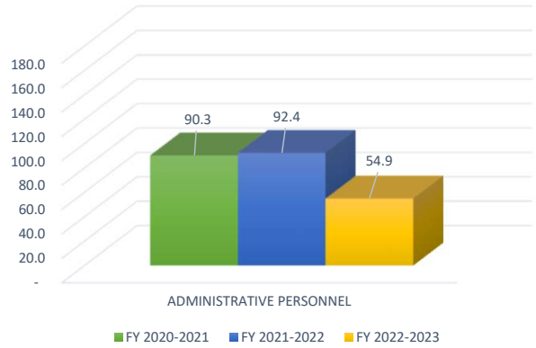
RATIO OF FULL-TIME EQUIVALENT STUDENTS TO FULL-TIME EQUIVALENT ADMINISTRATIVE PERSONNEL