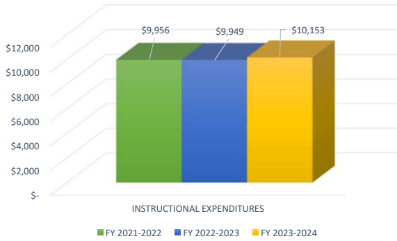
TOTAL INSTRUCTIONAL EXPENDITURES PER FULL-TIME EQUIVALENT STUDENT