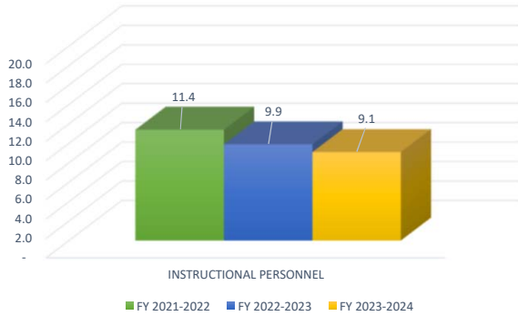
RATIO OF FULL-TIME EQUIVALENT STUDENTS TO FULL-TIME EQUIVALENT INSTRUCTIONAL PERSONNEL