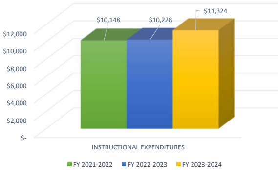
TOTAL INSTRUCTIONAL EXPENDITURES PER FULL-TIME EQUIVALENT STUDENT