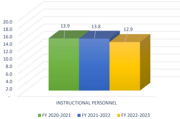
RATIO OF FULL-TIME EQUIVALENT STUDENTS TO FULL-TIME EQUIVALENT INSTRUCTIONAL PERSONNEL