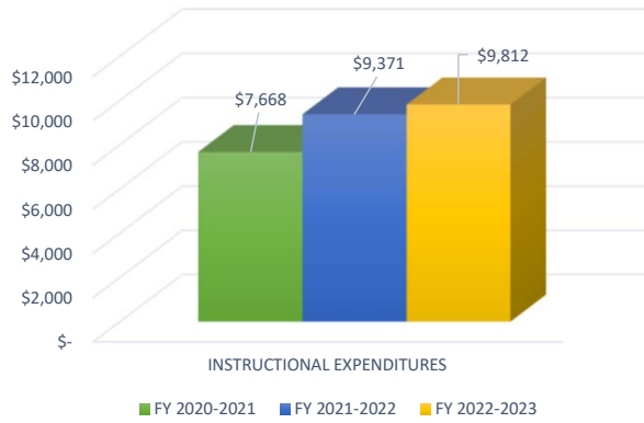
TOTAL INSTRUCTIONAL EXPENDITURES PER FULL-TIME EQUIVALENT STUDENT