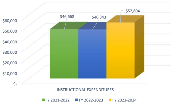
TOTAL INSTRUCTIONAL EXPENDITURES PER FULL-TIME EQUIVALENT STUDENT