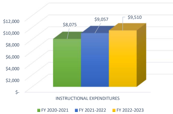
TOTAL INSTRUCTIONAL EXPENDITURES PER FULL-TIME EQUIVALENT STUDENT