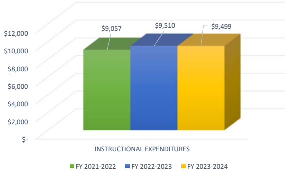
TOTAL INSTRUCTIONAL EXPENDITURES PER FULL-TIME EQUIVALENT STUDENT