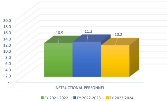
RATIO OF FULL-TIME EQUIVALENT STUDENTS TO FULL-TIME EQUIVALENT INSTRUCTIONAL PERSONNEL