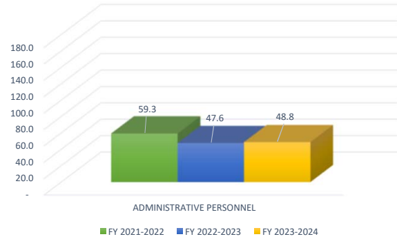
RATIO OF FULL-TIME EQUIVALENT STUDENTS TO FULL-TIME EQUIVALENT ADMINISTRATIVE PERSONNEL