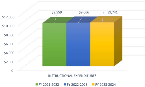
TOTAL INSTRUCTIONAL EXPENDITURES PER FULL-TIME EQUIVALENT STUDENT