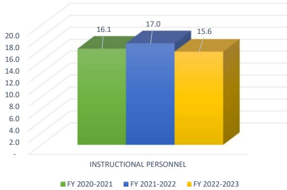
RATIO OF FULL-TIME EQUIVALENT STUDENTS TO FULL-TIME EQUIVALENT INSTRUCTIONAL PERSONNEL