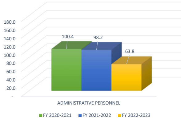
RATIO OF FULL-TIME EQUIVALENT STUDENTS TO FULL-TIME EQUIVALENT ADMINISTRATIVE PERSONNEL