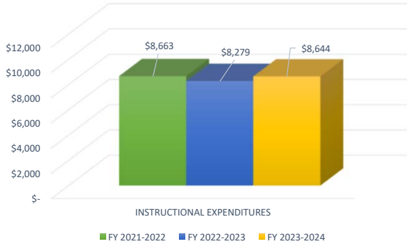
TOTAL INSTRUCTIONAL EXPENDITURES PER FULL-TIME EQUIVALENT STUDENT