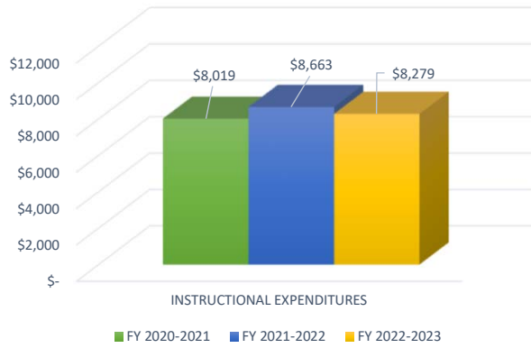
TOTAL INSTRUCTIONAL EXPENDITURES PER FULL-TIME EQUIVALENT STUDENT