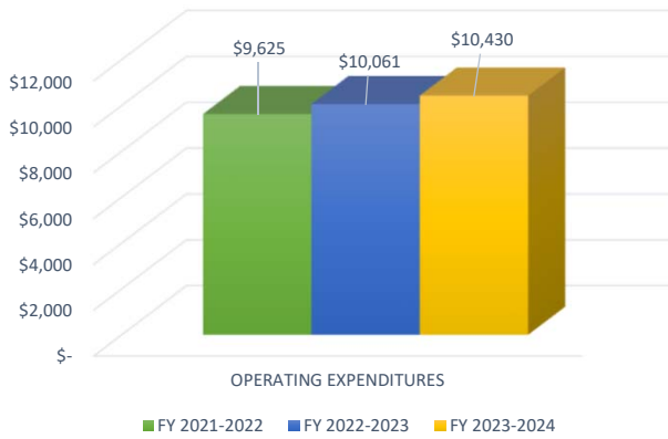
TOTAL OPERATING EXPENDITURES PER FULL-TIME EQUIVALENT STUDENT