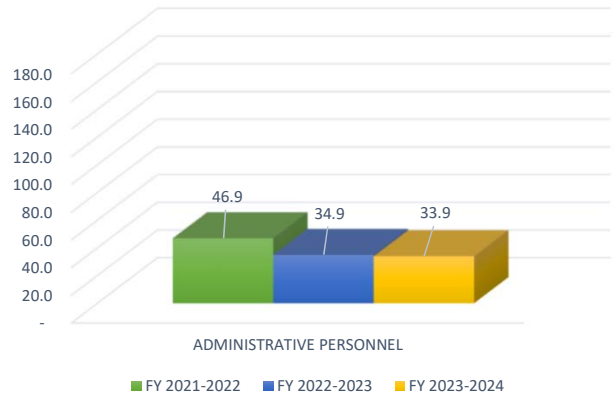
RATIO OF FULL-TIME EQUIVALENT STUDENTS TO FULL-TIME EQUIVALENT ADMINISTRATIVE PERSONNEL