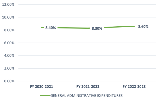
GENERAL ADMINISTRATIVE EXPENDITURES AS A PERCENTAGE OF TOTAL EXPENDITURES