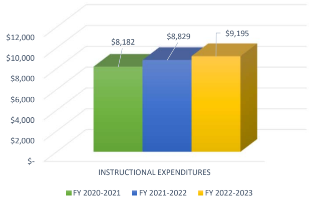
TOTAL INSTRUCTIONAL EXPENDITURES PER FULL-TIME EQUIVALENT STUDENT