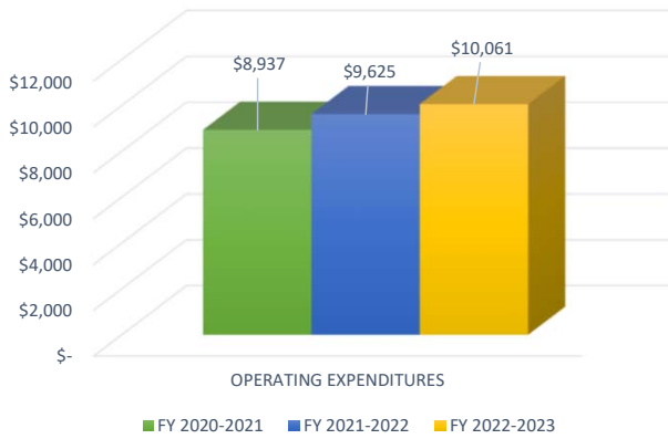
TOTAL OPERATING EXPENDITURES PER FULL-TIME EQUIVALENT STUDENT