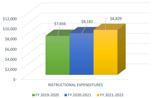
TOTAL INSTRUCTIONAL EXPENDITURES PER FULL-TIME EQUIVALENT STUDENT