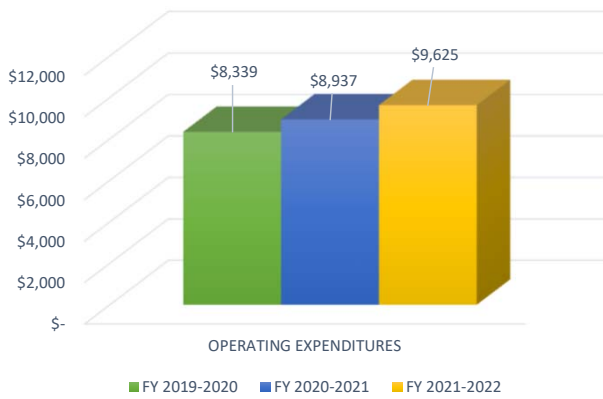
TOTAL OPERATING EXPENDITURES PER FULL-TIME EQUIVALENT STUDENT