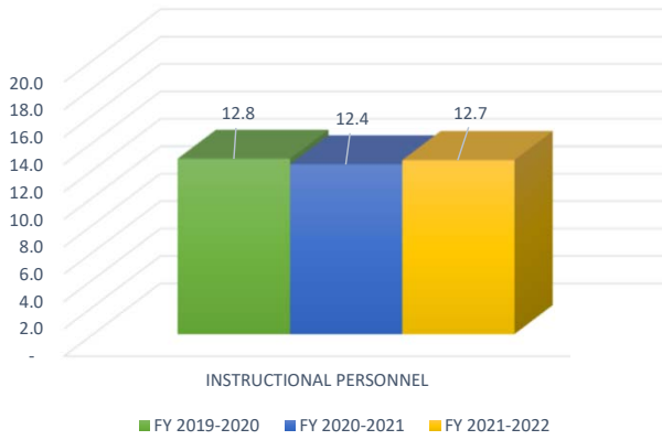
RATIO OF FULL-TIME EQUIVALENT STUDENTS TO FULL-TIME EQUIVALENT INSTRUCTIONAL PERSONNEL