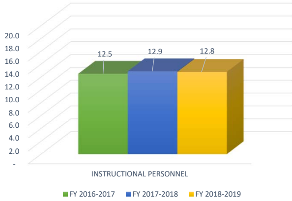
RATIO OF FULL-TIME EQUIVALENT STUDENTS TO FULL-TIME EQUIVALENT INSTRUCTIONAL PERSONNEL