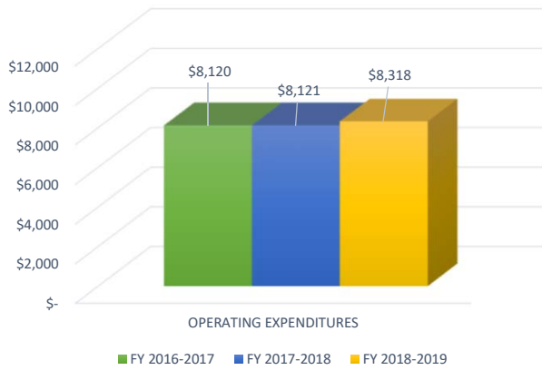
TOTAL OPERATING EXPENDITURES PER FULL-TIME EQUIVALENT STUDENT